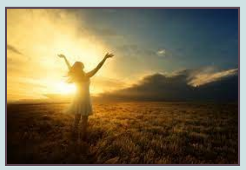
That everyone will see, will hear, will know... that you are the LORD OF ALL!