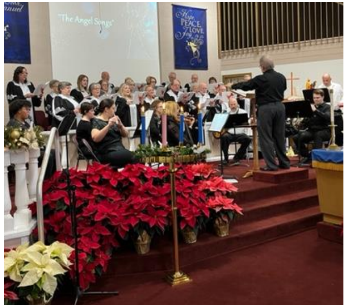
(2022 Christmas Cantata)

We are taking in the moments of the music, filling the service. Powerful!!!